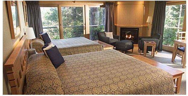
Deluxe accommodations at Bandon's Chrome Lake cottages.

We will help coordinate ride-sharing from either direction for those so inclined. What better way to enhance travel time than to swap stories, experiences and expertise with fellow TurfNet members!