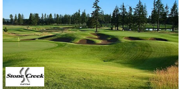
Arrive early and play Stone Creek Golf Club in Oregon City.