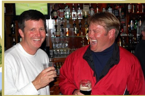
Old and new friends...