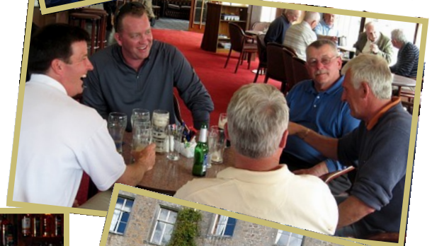
International camaraderie, Killarney