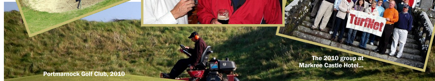
The 2010 group at Markree Castle Hotel...