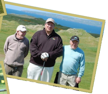
Post-round relaxation, Donegal, 2010