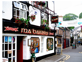
Carlingford, a quaint village in the east of Ireland.

Enjoy an escorted tour of Malahide Castle, Newgrange Megalithic site, Giants Causeway, Dunluce Castle, Walled City of Derry, Northern Ireland coastal tour and fishing trip, Trinity College, The Book of Kells and Carlingford Village.