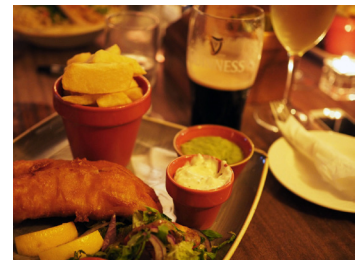
Food and drink are a big part of the experience!

Thursday's golf at Ballyliffin will also feature the 10th playing of the TurfNet Emerald Challenge/Jim Byrne Cup golf competition with our Irish greenkeeping counterparts. We will meet the Irish participants during Sunday's "Pairings Party" in Dublin.